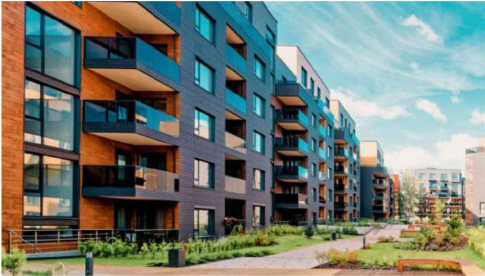
Wave City Launches New Luxury Flats

Realty firm Wave Group is expecting more than Rs 500 crore revenue from a new luxury housing project in its 4,200-acre township in Ghaziabad, Uttar Pradesh. The company has launched a new project 'Eden', spread across 5.2 acres, Wave Group said in a statement.