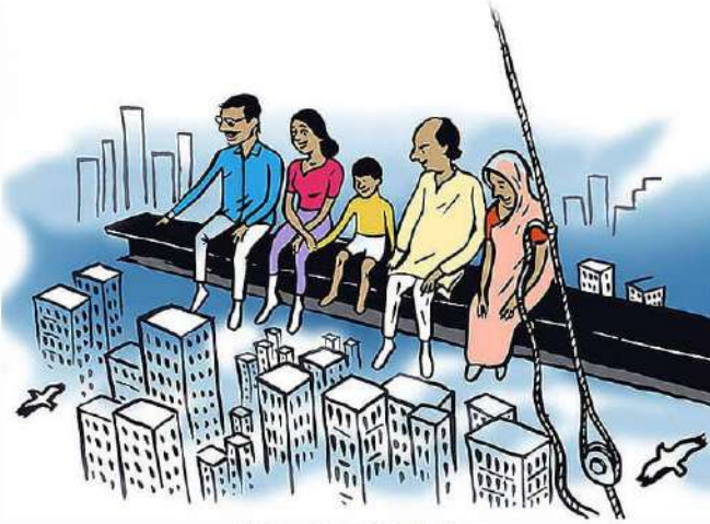
Illustration: Dominic Xavier/Rediff.com

Wave Group aims to generate over Rs 500 crore from its new luxury housing project 'Eden' in its 4,200-acre Ghaziabad township, Wave City. The project features 250 apartments and is expected to see strong sales.